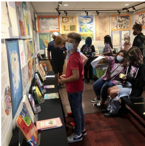
School class visiting the exhibition at Worlds of Words, AZ / USA

"Haus der Langen Rhoen", Oberelsbach (German edition)